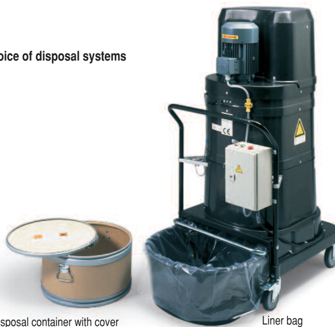
Disposal container with cover